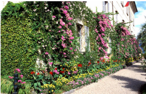
Palace and gardens of Bella Island

Excursion by boats to the Borromeo Islands